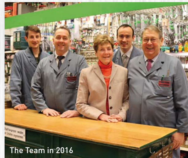
The Team in 2016

Since then, EISEN-DÖRING is run by the fourth generation and has enjoyed to be of service to its customers for the last 110 years.