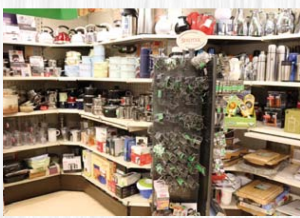
Here the housewife - or the master of the house - will find everthing that all kitchen needs.